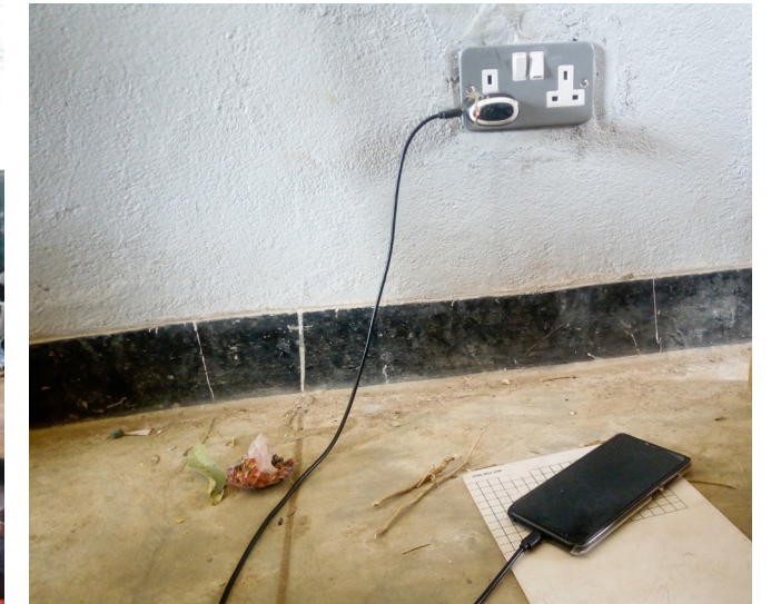
Teachers use the electricity to charge their mobile phones, which are used for educational videos