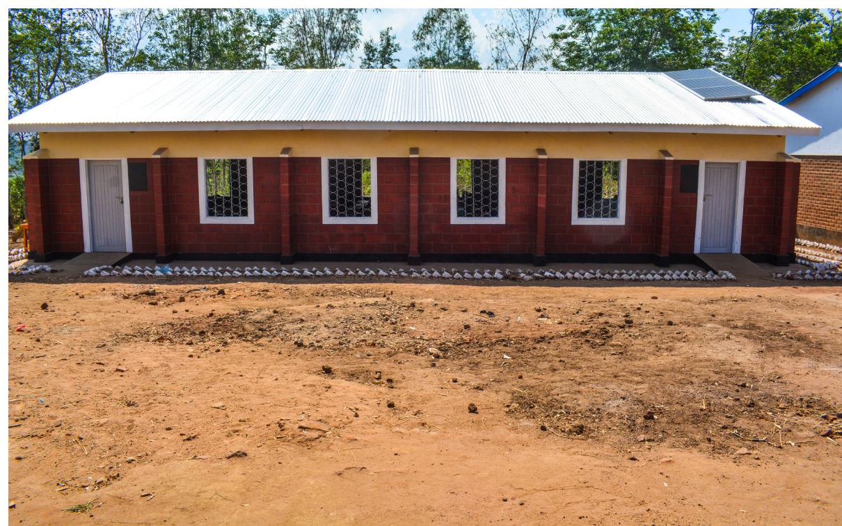
The new school in Chintchinda equipped with solar electricity