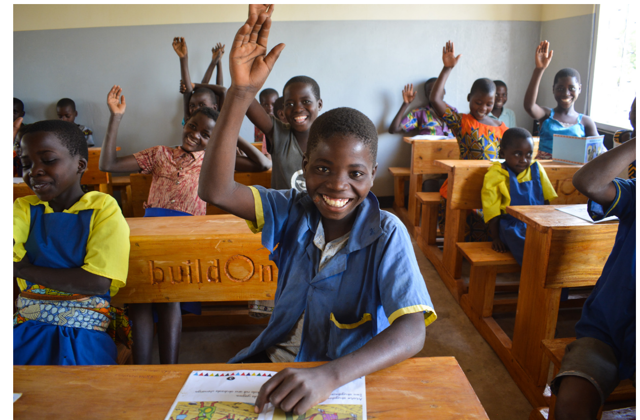
Having electricity has greatly improved the learning conditions for children in Chalaula