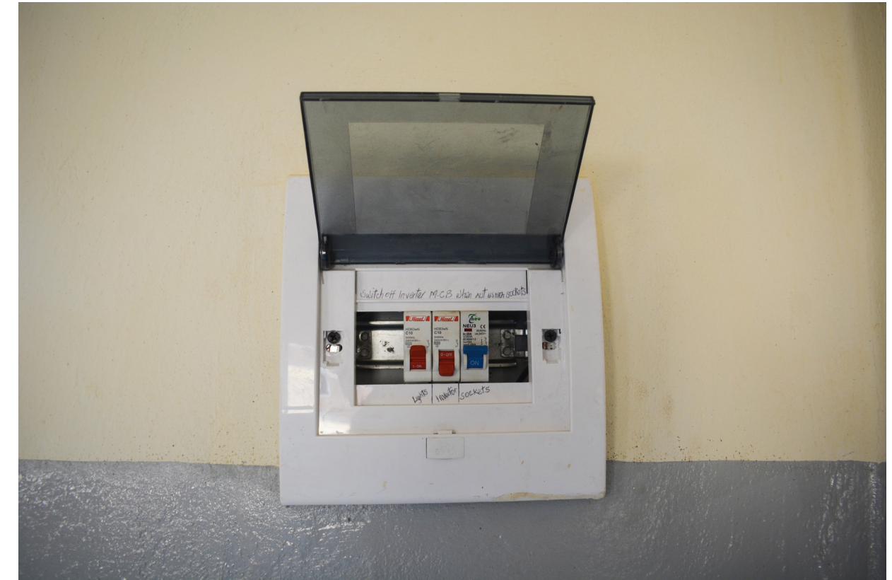
Electric panel on the new school