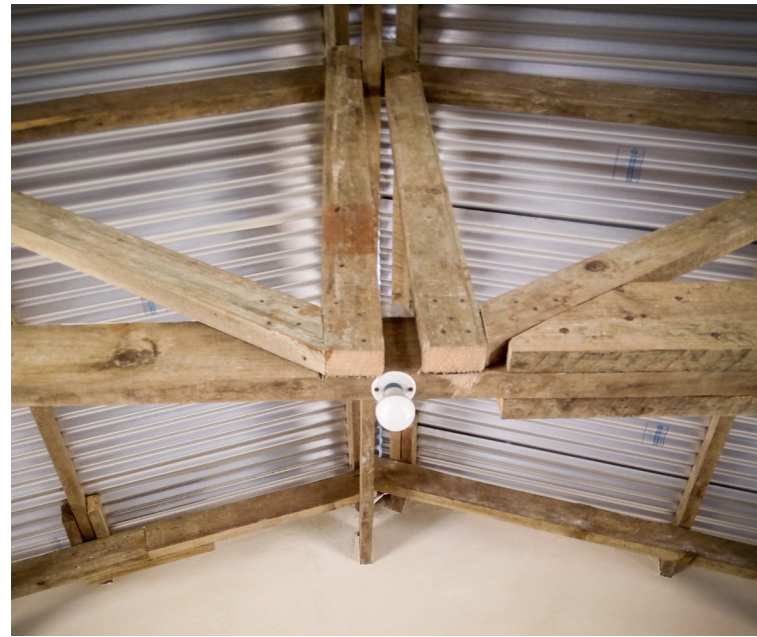
Solar-powered electricity in the classrooms

Circumstances in Chang'ombe finally began to change in October 2021 when the community partnered with buildOn to construct a new school block. Today, not only do the children attending this school have quality classrooms and desks to learn at, thanks to the partnership of SCB, they also have solar power. "The