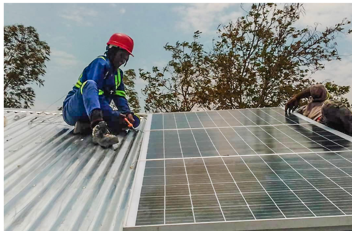
Installing solar panels on the school