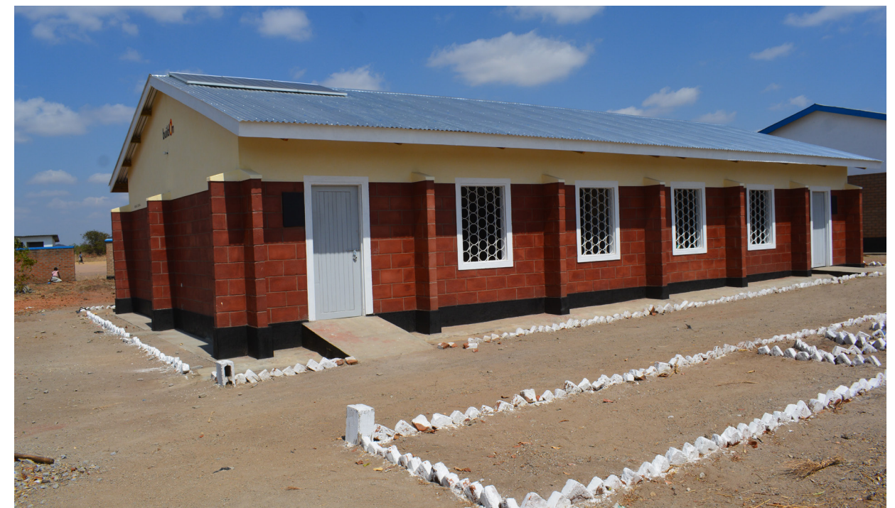
The new classrooms in Kachule complete with solar panels