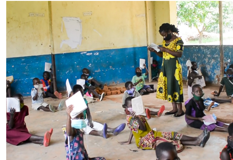
Students in Chang'ombe used to learn on the floor

especially when we have very tight schedules during the day hours or in cases where some emergencies have arisen at night, we can easily organize the meetings instantly and make a decision at night. At the same time electricity has also helped in minimizing cases of theft at the school, unlike in the past when the school was in total darkness. Electricity will also simplify the process of teaching and learning because, for example, we will be able to use a computer to show a video explaining a science experiment we are conducting. In the past, most concepts were just explained theoretically and it was difficult for most learners to grasp the content. We can also use these same audio visual methods to easily show a video featuring a role model or expert in a field that can motivate learners without that person physically visiting the students at the school. Honestly, the electricity installed at the school will have a great impact on the community."